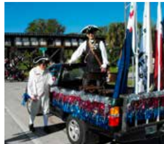
Veterans Day Parade Melbourne, FL

Get your uniform now and sign up to join this handsome - and beautiful crowd.