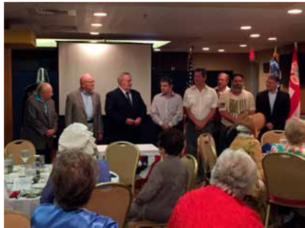
Induction of 8 NEW members !!