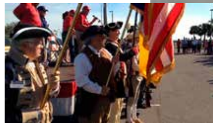
Veterans Day Ceremony Merritt Island Veterans Center