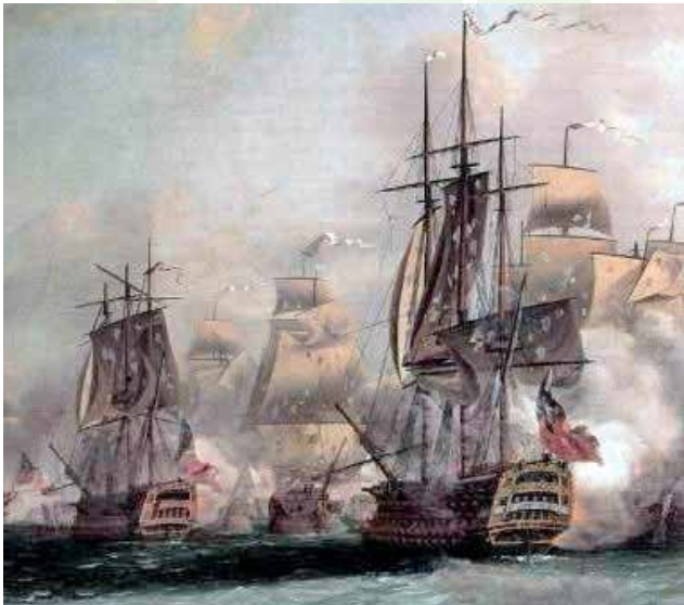
French Ships at the Siege of Savannah

The second assault column was commanded by the Swedish Count Curt von Stedingk, who managed to reach the last trench. He later wrote in his journal I had the pleasure of planting the American flag on the last trench, but the enemy renewed its attack and our people were annihilated by cross-fire.[6] He was forced back by overwhelming numbers of British troops and was pushed back with only some 20 men left; all, including himself,