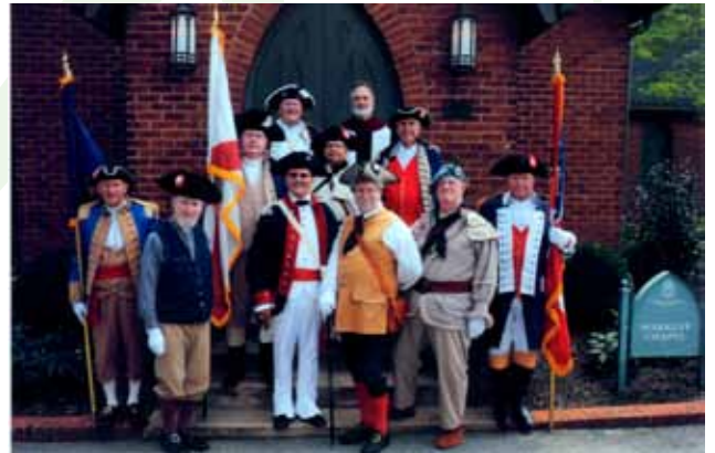
Florida Chapter Color Guardsmen in attendance at the Memorial Service held at the Christ Church Episcopal (below) in Greenville, South Carolina.

Get your uniform now and sign up to join this handsome - and beautiful crowd.