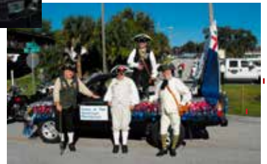
Veterans Day Parade Melbourne, FL

Get your uniform now and sign up to join this handsome - and beautiful crowd.