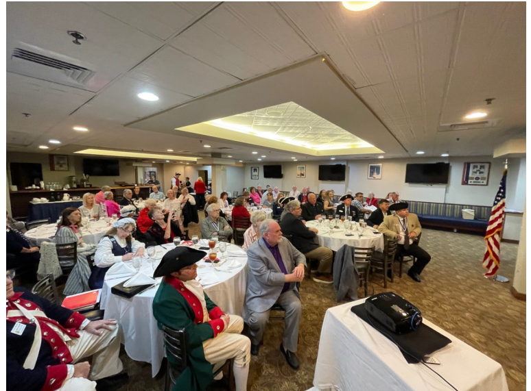
Well Attended meeting (54 members and guests)