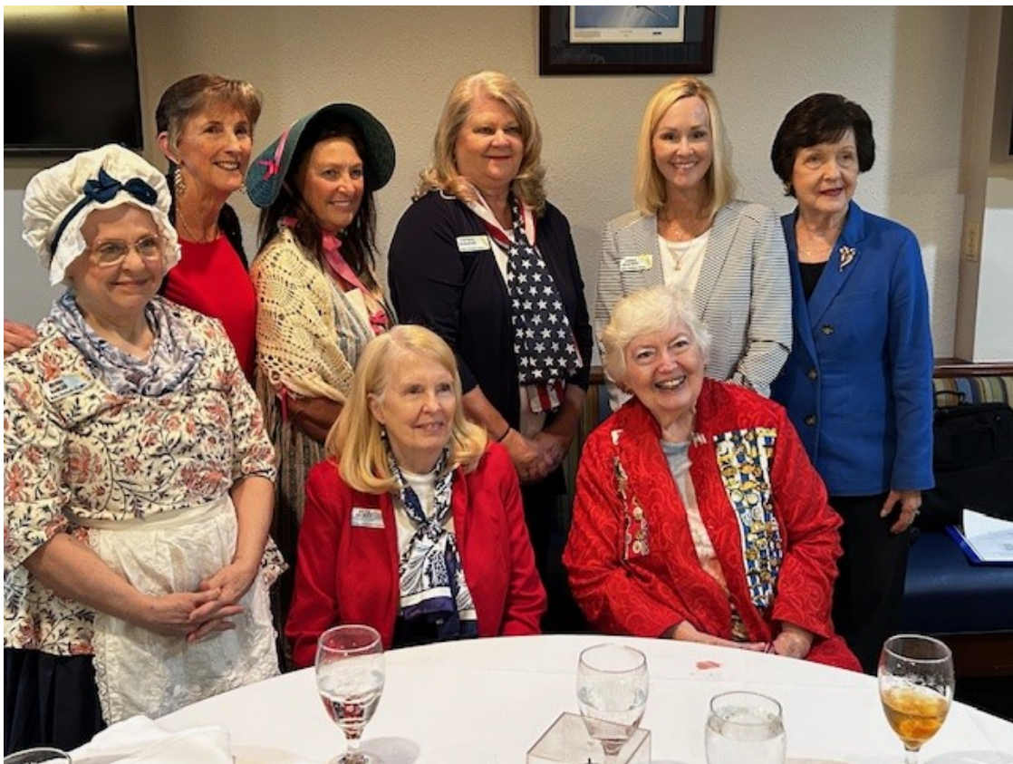
DAR Rufus Fairbanks Chapter Ladies