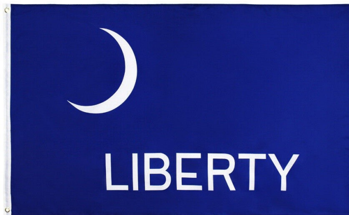
The Fort Moultrie Flag

The Battle of Bunker Hill was fought on June 17, 1775. American colonists were surrounding Boston which at the time was full of British troops. Across the Charles River from Boston was the Charlestown Peninsula where the town of Charlestown and Breed's Hill, as well as Bunker's Hill, were located. A few days before the 17 th , the colonists received word the British would attempt to try to break out of Boston, and they sent 1200 men under the command of William Prescott into the quiet of the night and built fortifications on those two hills. It's there that it's rumored the first continental flag was flown.