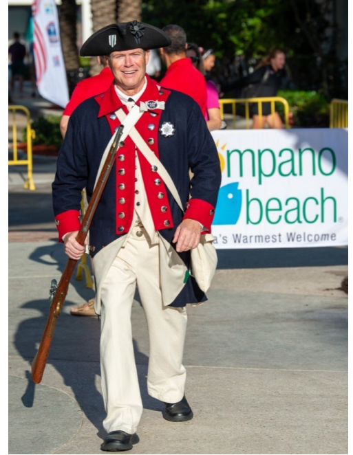
1st Amphibious Landing at Pompano Beach 14 March