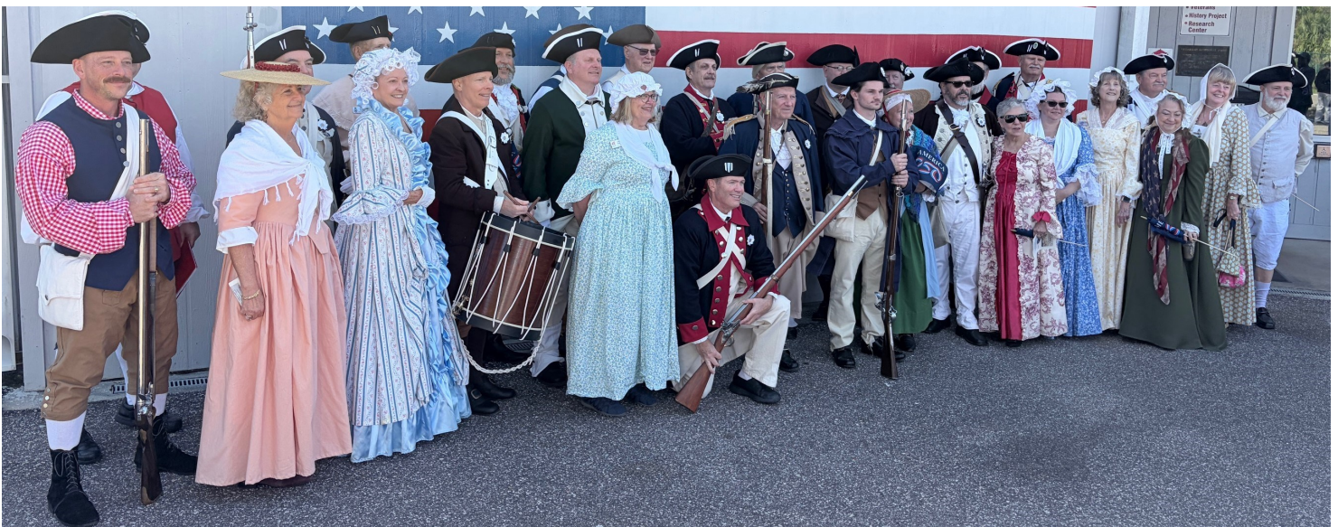
Last Naval Battle at VMC