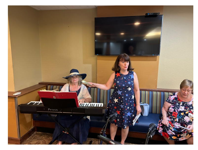
Music for the meeting provided by the DAR