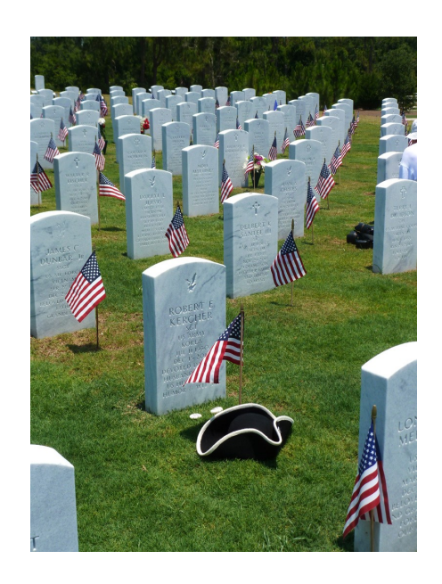
Remember our Veterans

16 Dec — Wreaths Across America Special Ceremony 1500-1630 at Pinecrest Cemetery on Clearlake Road in Cocoa