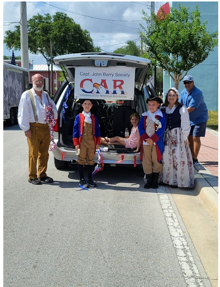
Cocoa Memorial Day Parade