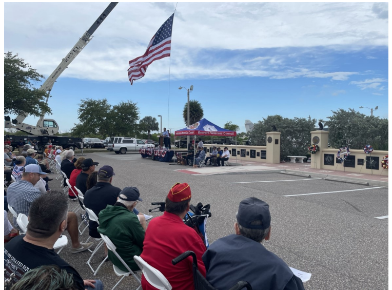
VMC Memorial Day Services

Published in the Florida Patriot Summer 2021 page 14