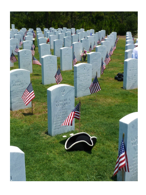
Remember our Veterans

11 Sep — Patriot Day 9/11 Remembrance Ceremony at VMC 1630-1900. Details in July