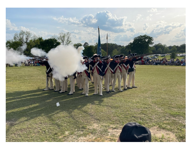
U.S. Army "Old Guard" at Camden SC to honor the 14 Revolutionary Soldiers

The SCIAA team found the remains of 14 Revolutionary War soldiers at the historic Camden Battlefield and Longleaf Pine Preserve, the site of a 1780 battle that claimed more lives than any other in the revolution.