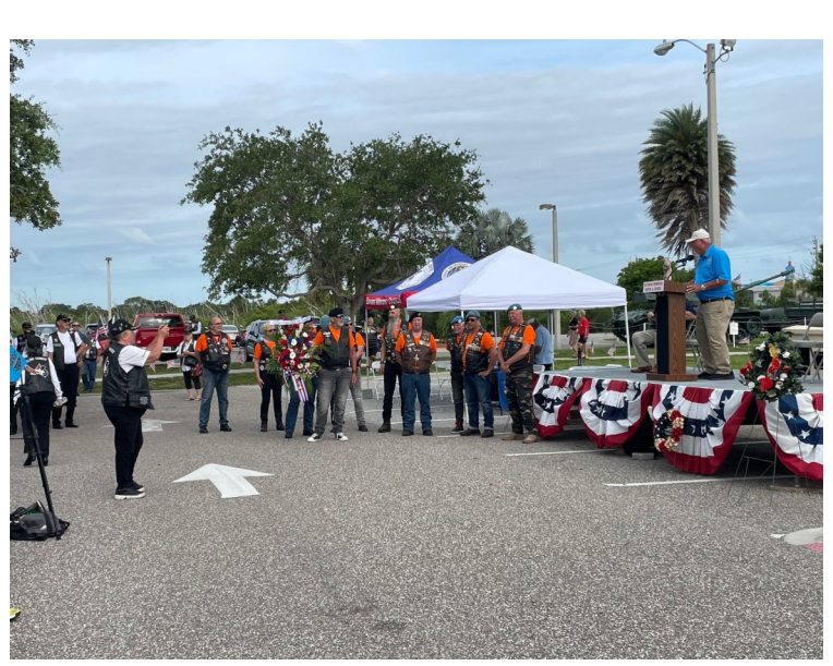
Memorial Day at VMC