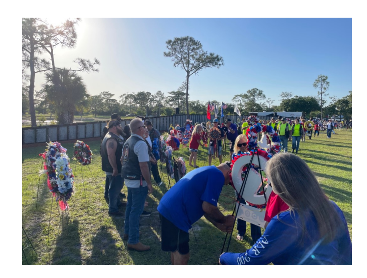
Vietnam and All Veterans Reunion Wickham Park May 1st to 7th