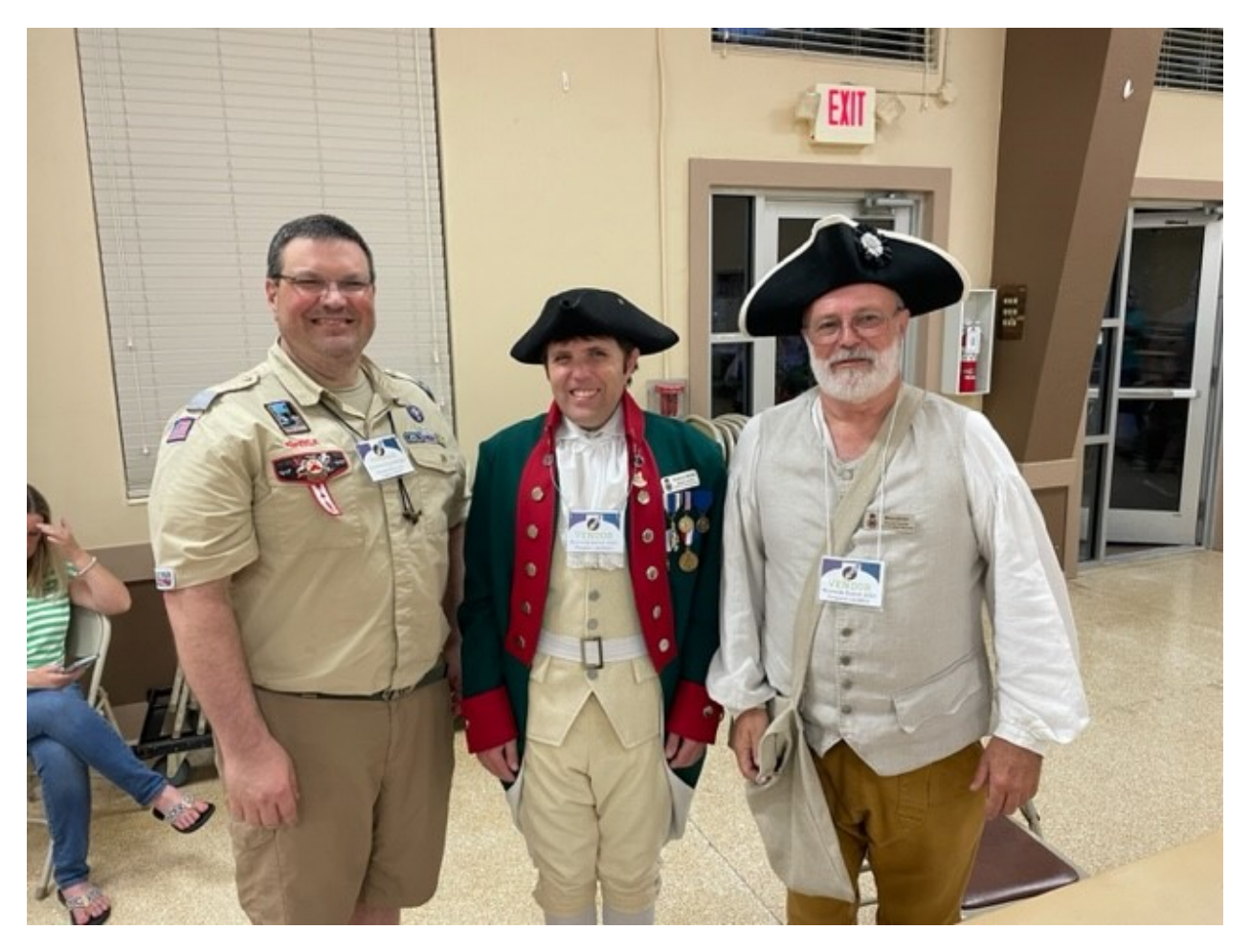
Scouting Event in Melbourne—18 May