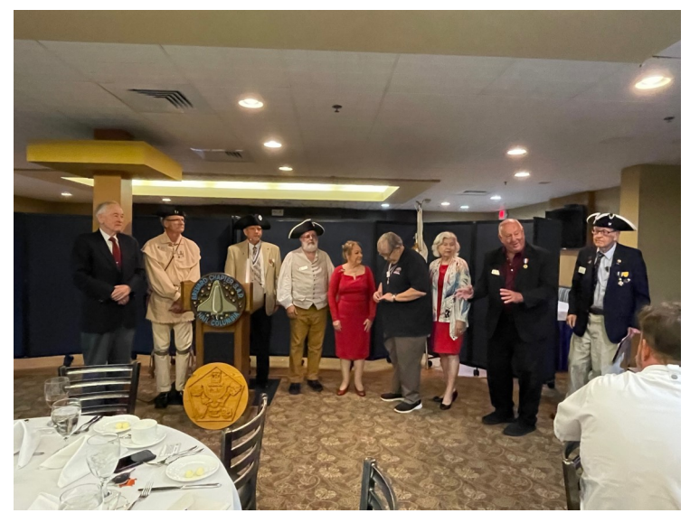
LNB Planning Committee