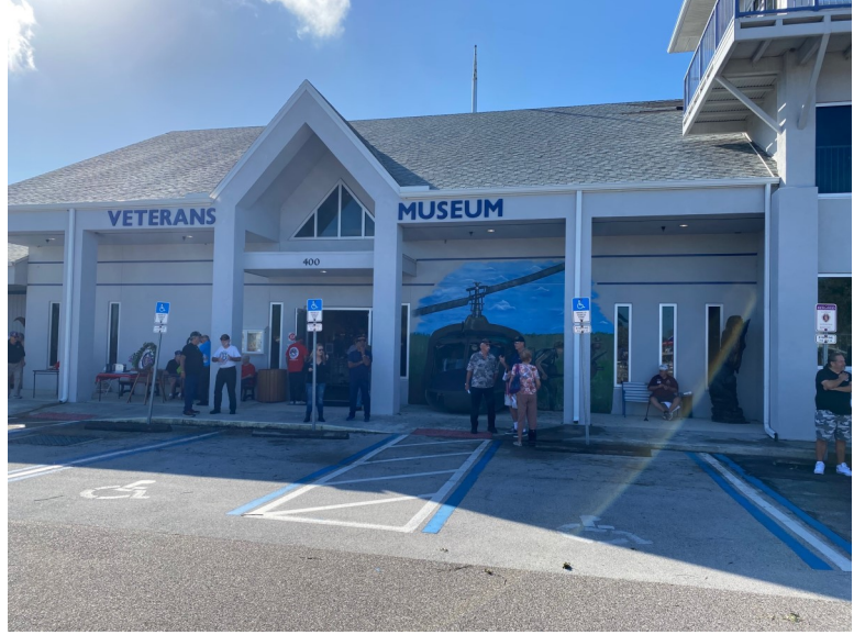
Brevard Veterans Memorial Center

https://veteransmemorialcenter.org/ upcoming-veterans-events/