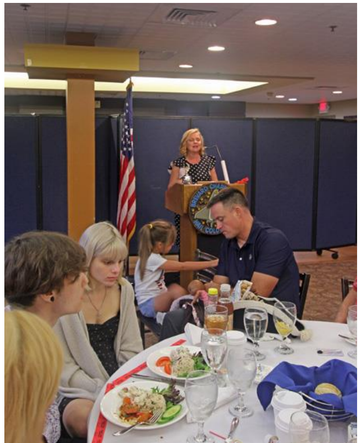
October 2019 Meeting