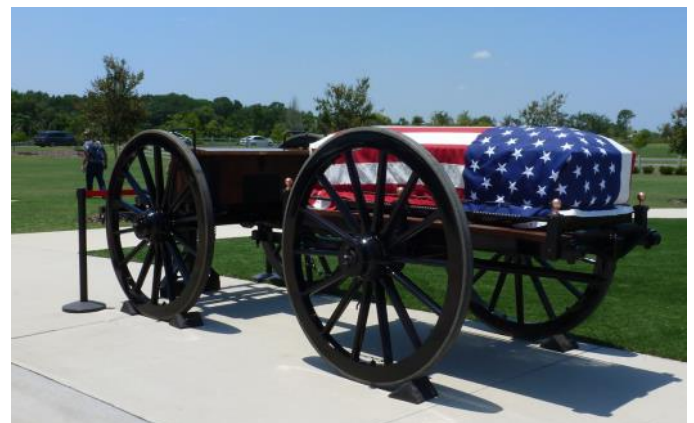
Cape Canaveral National Cemetery