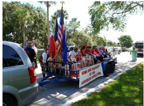
2017 4th of July Melbourne Parade