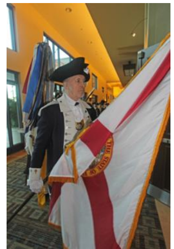
Color Guard at Fall BOM