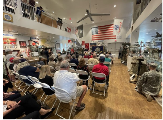
Veterans Memorial Center Museum