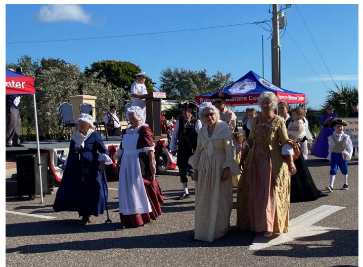
DAR Participants - The DAR 250th anniversary marker was dedicated