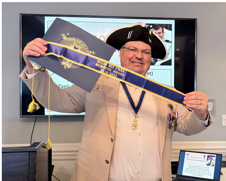
USS Stark Memorial Award 2024-2025