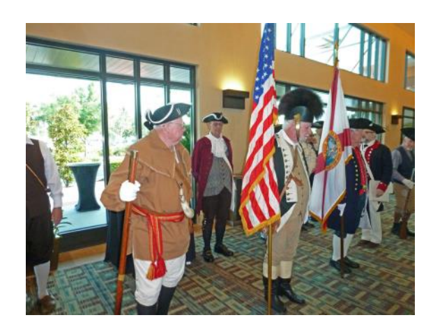
Color Guard at Spring BOM