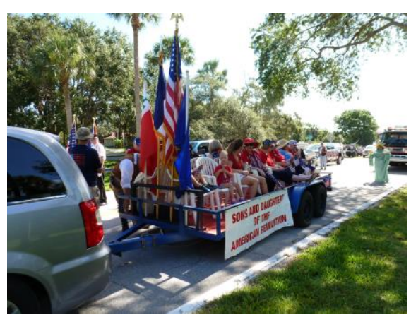
2017 4th of July Melbourne Parade