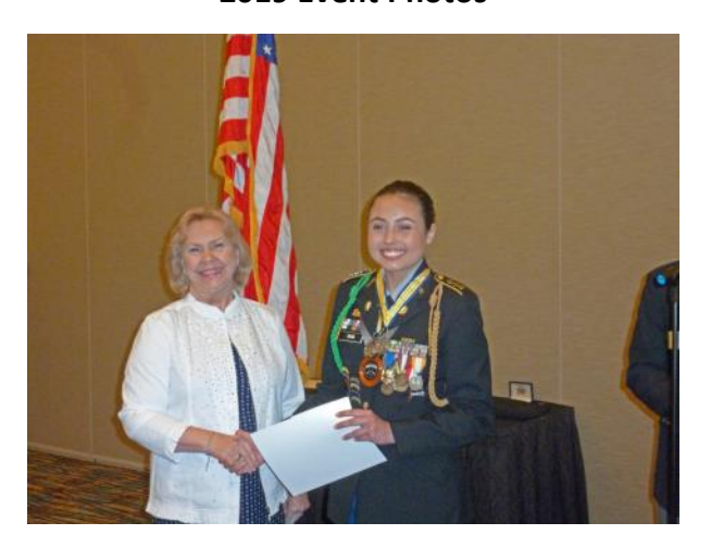
Spring BOM Ladies Auxiliary Youth Awards