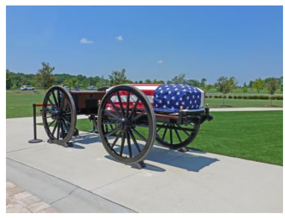
Memorial Day Cape Canaveral National Cemetery