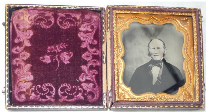
1850's/1860's Portrait inside a Union Case

Photography became popular in the late 1840's.